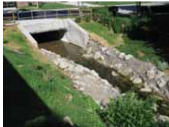
Before and after photos of the Arcadia Boulevard Bridge Replacement Project that replaced a 50 year old under-capacity metal culvert with a new, concrete box culvert.

Several projects are underway or completed throughout the City.